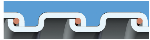
Square-Locked Design with integral bonding wire 1/2" through 1-1/4"