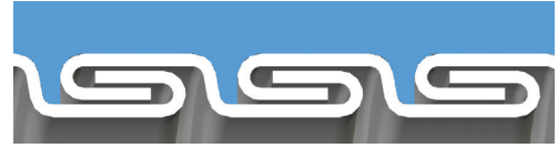
Interlocked Design 1-1/2" through 3" with no bonding wire