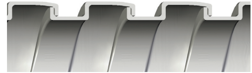
Square Locked Design 5/16" through 3/4"