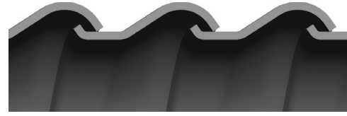
Angle-Lock Design 3/8" through 4"