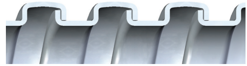
Square Lock Construction