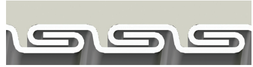
Interlocked Design 1-1/2" through 4" with no bonding wire