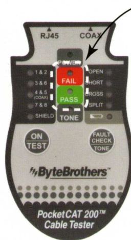
Instant blue LED PASS/FAIL Indication