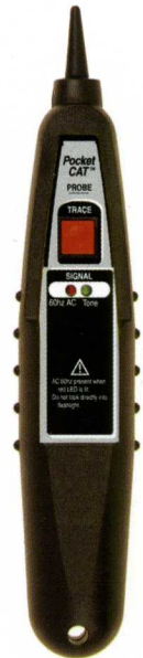
FILTERED, LIGHTED TONE PROBE (CTX200P KIT)

The perfect testers for any toolbox. Performs a TIA568 test on CAT5/6 network cable (RJ45) with instant PASS/FAIL results. Ruggedized and cushioned for toolbox use with a hidden drawer for remote storage. Includes a tone generator. Available with or without a filtered, lighted inductive tone probe. Coax remote also included. Ruggedized for field use.