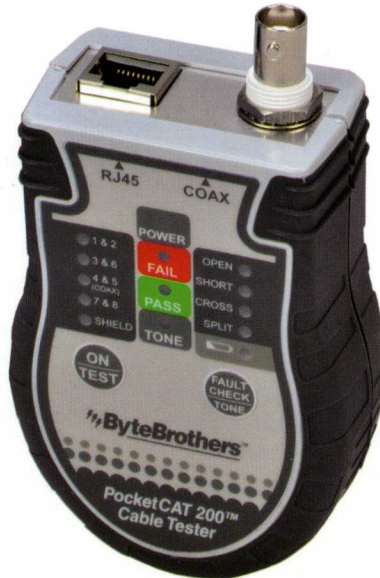
RUGGEDIZED FOR FIELD USE