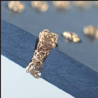
LGA Cross Section

The key to this highly innovative technology is the CIN::APSE button-contact. The contacts themselves are made from randomly wound gold plated molybdenum wire, which are then loaded into a plastic insulator configured to the exact requirements of your application. By using different sizes of contacts, plungers, and spacers we can create a wide range of contact configurations.