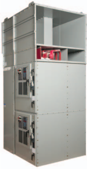
Arc Resistant AMPGARD