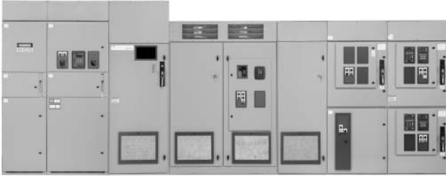
AMPGARD Motor Control Assembly with Main Breaker, SC 9000 AFD, RVSS and Two-High FVNR