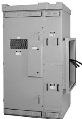
Outdoor Medium Voltage Switch