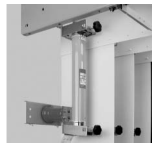
MVS-C Fuse Mounting

Fuse mountings: Complete three-phase fuse mounting assemblies or fuse live parts are available that are fully compatible with MVS-C switches. The fuse mountings are intended for use with Eaton's fuses.