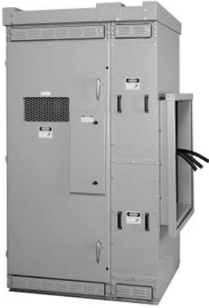
Outdoor Medium Voltage Switch—MVS Cable Connection to Liquid-Filled Transformer