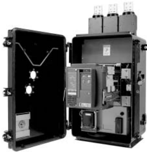
CM52 Network Protector