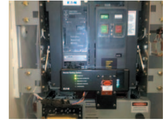
Remote Racking System

energized bus work while the door is still closed to the “test” position either through an external pendant or through communications.