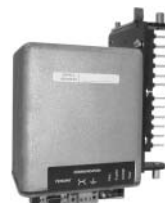
MPCV Communications Relay for General Electric Network Protectors