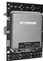
MPCV Communications Relay for Eaton Network Protectors