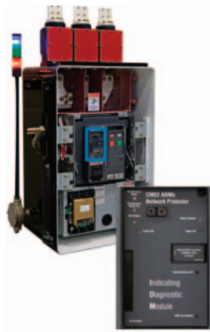
VaultGard™ Arc Reduction Maintenance System Indicating Diagnostic Module

The CM52 Network Protector is available with the NPARMs module (Arcflash Reduction Maintenance System).