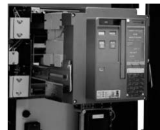
Deadfront, Drawout Breaker