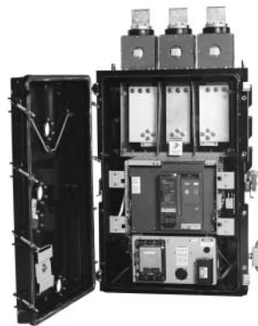
CM52—Highlight of Relay Module