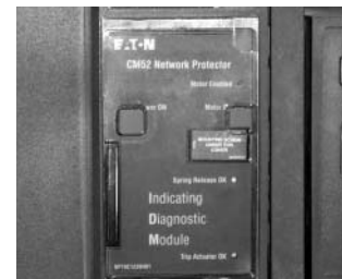
Indicating Diagnostic Module (IDM)