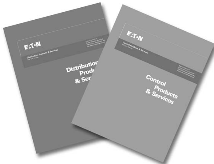
Two Volumes of Outstanding Products