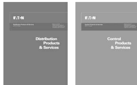
Each volume has its own publication number for ordering. Order one or both volumes.

We've simplified product information by dividing our catalog into two volumes: Distribution Products and Control Products. Volumes can be ordered separately.