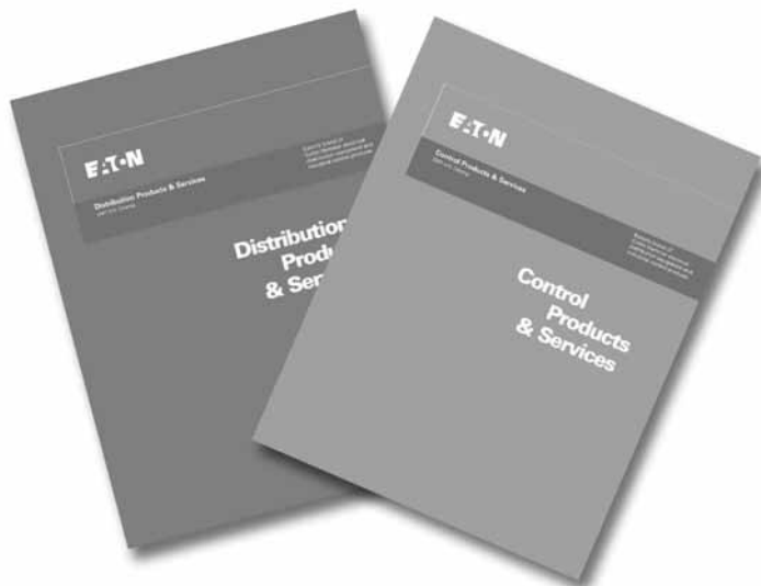
Two Volumes of Outstanding Products